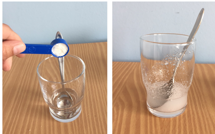
Fig. 5 Thickening of water for the semisolid swallowing test