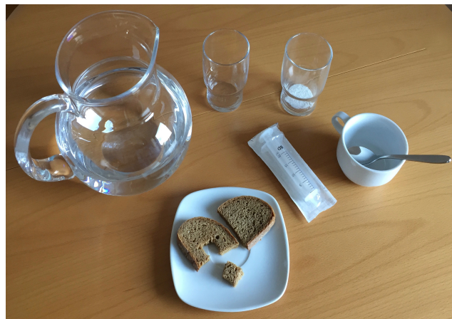
Fig. 1 Materials for the GUSS