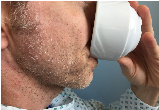
Fig. 8 Drinking 3ml of water from a cup