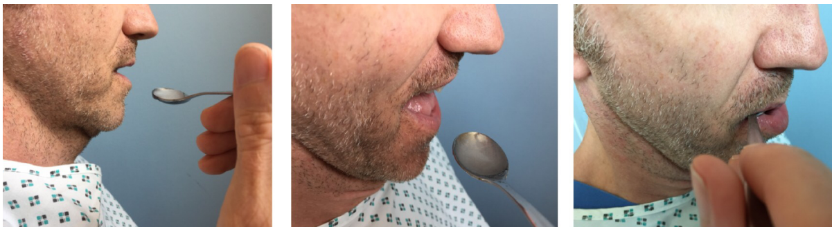
Fig. 6 Administration of a half teaspoon of thickened water