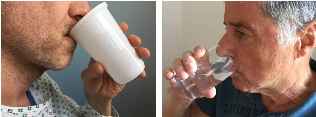
Fig. 10 Drinking 50ml from a cup or a glas