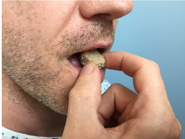
Fig. 12 Swallow attempt with bread (1.5x1.5cm) Subtest "SOLID"