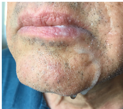
Fig. 2 Salivadrooling